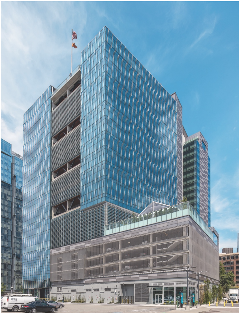
255 King, Seattle, WA, USA

OPACI-COAT-300® is a registered trademark of ICD High Performance Coatings + Chemistries.